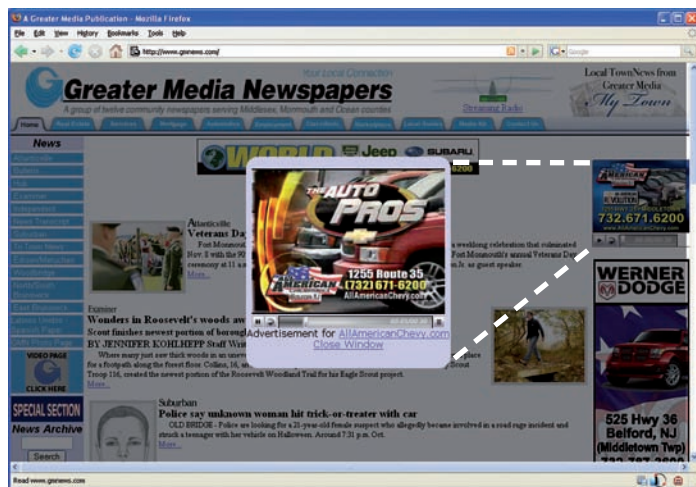
On your homepage—a tile ad that opens a video player window when clicked